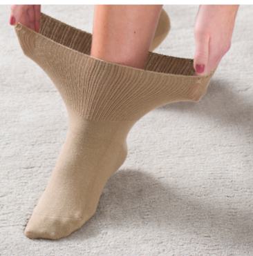
Style shown: Fuller Fitting Socks

If your feet and legs are very swollen, Cosyfeet offer a Fuller Fitting Sock and a Softhold® Ultra-roomy Knee High. They are exceptionally roomy and easy to get on and off swollen feet and legs.